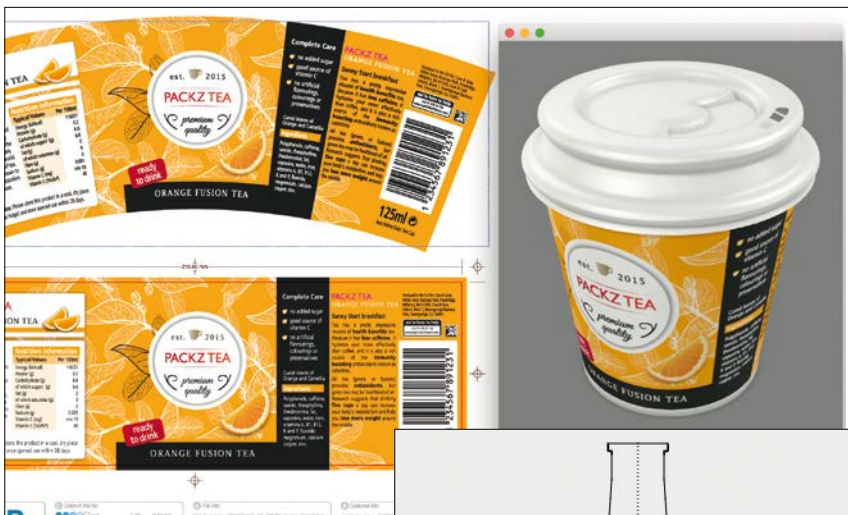
Cup deformation with Live 3D view

PACKZWARP uses a powerful can modeler to generate a framework for the mechanical distortion of the metal can. With a few distortion measurements , Packz generates the destination grid, warps the rectangular design around the metal can and shows the 3D result instantly.