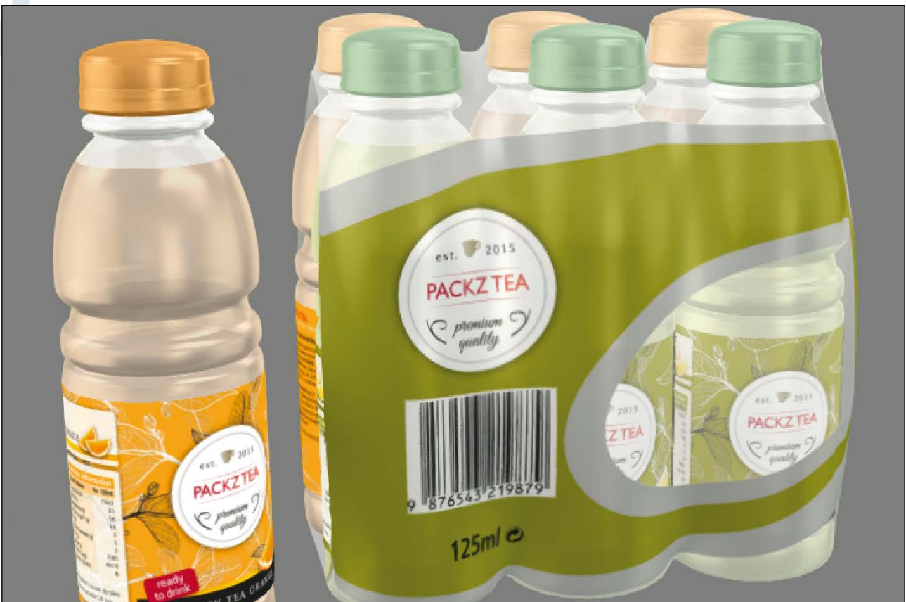
Asymmetric shrink sleeve with real-time simulation

A 3D shaped model coming from a 3D application is the basis for the creation of the shrink sleeve. The direct link between PACKZ and the optional IC3D software from Creative Edge provides a real-time simulation of the shrink sleeve on the 3D model. The shrink sleeve design is adjusted where needed after the warping results are displayed.