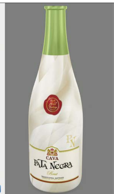
Symmetric shrink sleeve spinner with Live 3D view