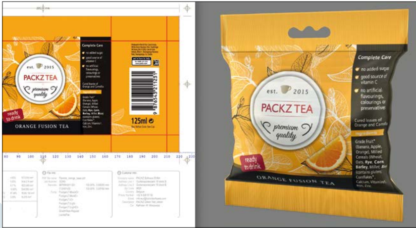
Flexible Packaging with 3D synchronized view

White Underprint can be used to combine multiple shapes. This speeds up the creation of white, varnish, embossing and braille plates. The Dimension Lines automatically create arrows with distances to indicate the size of the design.